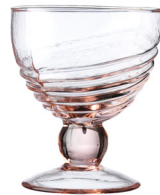
BOBBELS CHAMPAGNE GLASS

SKU: G2021-06 Material: recycled glass Color: curry Size: 11 x 10 cm