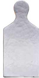
HORS D'OEURE SERVING BOARD

SKU: G2021-03 Material: recycled glass Color: pink Size: 21 x 9,5