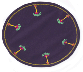
PALM TREE PLACEMAT

SKU: D2021-01 Material: cotton Colors: blue & green Size Ø35 cm