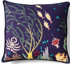
UNDER THE SEA PILLOW

SKU: P2020-10 Material: cotton Colors: dark blue Size: 40 x 40 cm