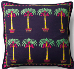
PALM TREE PILLOW

SKU: P2020-11 Material: cotton Colors: red Size: 40 x 40 cm