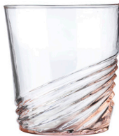
SWIRL WATER GLASS

SKU: G2021-04 Material: recycled glass Color: pink Size: 28 x 12,5