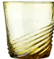
SWIRL WATER GLASS

SKU: G2021-01 Material: recycled glass Color: pink Size: 9,5 x 8