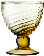
BOBBELS CHAMPAGNE GLASS

SKU: W2021-04 Material: recycled glass Color: pink Size: 17 x 9 cm